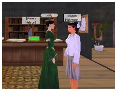
Figure 2: Talking to Computer-Based Agents

The River City curriculum is a middle school science unit designed around national content standards and assessments in biology, ecology, epidemiology, and scientific inquiry ( http://muve.gse.harvard.edu/rivercityproject/ ). In the River City MUVE curriculum, students work in teams of three to collaboratively solve the problem of why the residents of River City are falling ill. Students travel back in time—into a series of virtual worlds—to the period in history that scientists were just discovering bacteria.